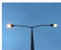
C). Street lights