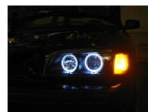
D). Car lights

15). Look at the picture. What time of day do you think the picture shows?