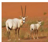
C). Arabian Oryx