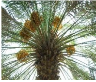
A). Date Tree

3). Look at the pictures. Circle the picture that protects you from rain.