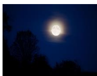
B). Moon light