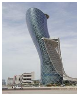
A). Capital Gate

6). Look at the pictures below. Circle the picture of the built environment.