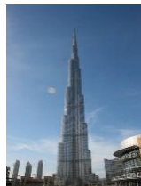
B). Burj Khalifa