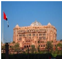
A). Emirates Palace

5). Look at the pictures below. Circle the picture of the natural environment.