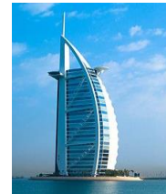
D). Burj Al Arab

6). Look at the pictures below. Circle the picture of the built environment.